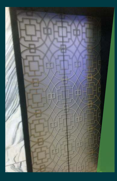
Custom graphics on elevator door